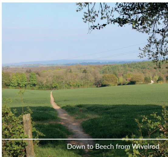
Down to Beech from Wivelrod

This information has been prepared to increase public awareness of, and to provide guidance on, the spectacular footpaths and bridleways in and around Beech village. In particular, it is hoped that this aids recreational and educational activities for the community of Beech and visitors.