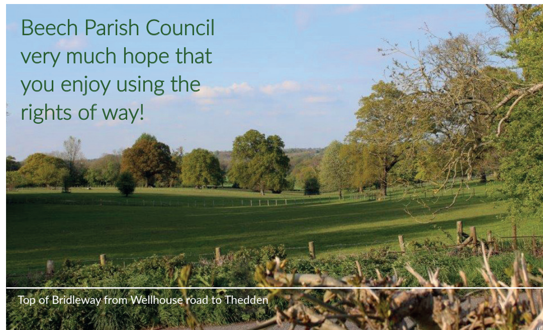
Top of Bridleway from Wellhouse road to Thedden

Beech Parish Council very much hope that you enjoy using the rights of way!