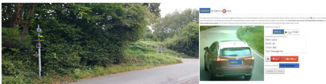
EHDC camera in action

These systems are operated by local volunteers and will hopefully be part of the Community Speed Watch scheme, they will enable identification of speed vehicles over a more prolonged period rather than just for the hour villagers stand roadside. The camera systems help gather evidence which can then be sent to the police for follow-up action and enable more targeted use of Roadside Police speed gun operators. The images are checked by volunteers to ensure that the registration numbers match the description of the speeding vehicles against the DVLA records.